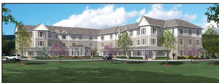
Artist rendering of The Residence at South Windsor Farms, a senior community being built by The Congress Companies in South Windsor, Conn.