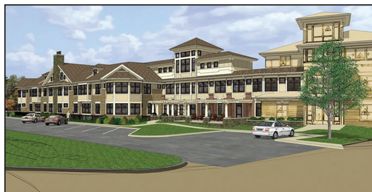
Artist rendering of completed renovation and addition to Golden Pond Assisted Living Residences in Hopkinton, Mass.

Congress' commitment to its consultative approach, to listening to its clients' needs and vision is what has made the company so well regarded in the surety, banking, and the development and construction communities. As a solid and reliable company with formidable construction, design and development, and management capacity, Congress will undoubtedly continue its legacy into a future as rich as its history.