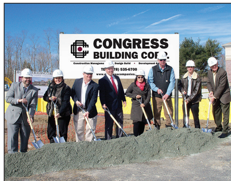
The Congress Companies and Golden Pond Resident Care Corp. co-hosted a groundbreaking ceremony on March 13, 2013 to celebrate commencement of construction on phase 2 of Golden Pond Assisted Living Residences in Hopkinton, Mass.